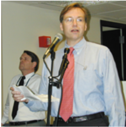
Managing Editor STEVE COLL congratulates the work of the five Pulitzer finalists.