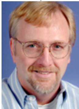
Style reporter DON OLDENBURG has written a book for dog lovers.

Picture Editor MICHEL DUCILLE participated in an historic, one-day documentary of the African continent called A Day in the Life of Africa with nearly 100 of the world's other top photojournalists (Hardcover, Tides Foundation, September 2002). All pub-