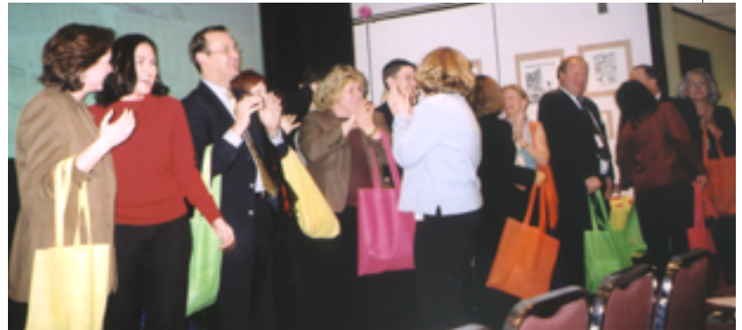
The winners of the President's Club Award, which includes a trip in March to St. Thomas in the U.S. Virgin Islands, celebrate at the end of the annual year-end awards presentation.