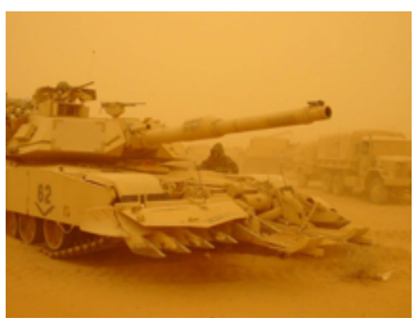
of a crew of an M1A1 Abrams tank named "Baghdad or Bust" working to get it ready during a sandstorm on March 26 for a drive toward Baghdad by forces of the 3rd Infantry Division.