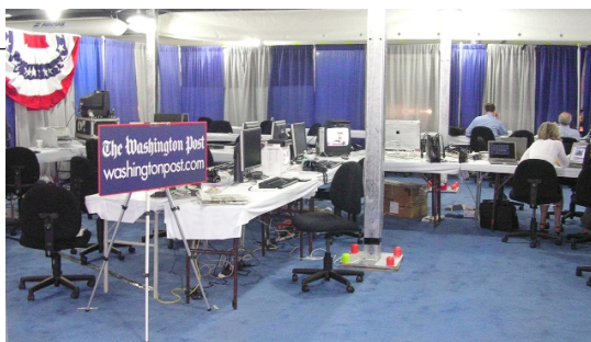
The Post's space outside Boston's FleetCenter described by reporter Howard Kurtz as a "cozy little space in an incredibly ugly, two-story white structure outside the arena, next to the elevated subway and near the 20 porta-johns..."