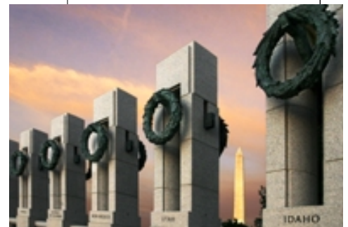
Post photos available for purchase through the online store include this photo of the World War II Memorial .