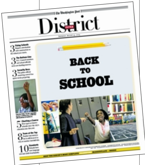
The District Extra's Back To School issue.

sheets in both English and Spanish for students in fourth through eighth grades. The objective of the program is to use the newspaper to learn more about Hispanic culture and history and the contributions of Hispanic Americans during Hispanic Heritage Month. Other curriculum being considered cover the U.S. Constitution and pandas.