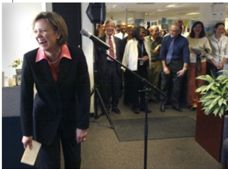
Pulitzer Prize winner Dana Priest shares a laugh with the Newsroom during her acknowledgement speech.

year's winner of the Pulitzer for beat reporting for her series, "The CIA's Secret War."