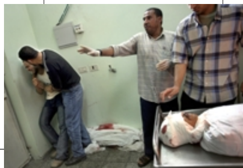
Comforted by a friend in the morgue of Beith Hanoun hospital, a weeping man breaks down after seeing the body of his brother, who was shot by Israeli snipers. (Editor's note: Photo won "International News First Place.")