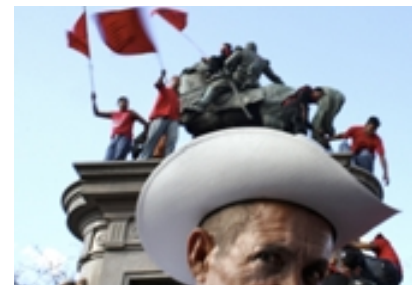
Stopping violence has become a constant rallying cry for local political parties in El Salvador, where it seems the cold war never ended. Communists still fight it out with nationalists in local elections. Supporters of the left wing FMLN, the former guerilla movement turned political party, attend a rally in the city center. (Editor's note: Photo won "Portfolio Second Place.")