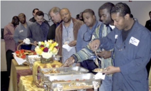
College Park employees enjoy a catered dinner immediately following their awards ceremony. Springfield did the same the following evening.