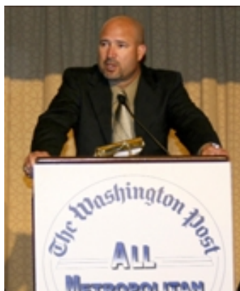
Washington Nationals Manager Manny Acta delivers the keynote address. He recalled growing up in the slums of his native Dominican Republic and never imagining that one day he'd be managing the baseball team of this nation's capital, making the point that everything is within reach. He then said, "Not everyone will go on to be professional athletes and that's okay. Athletes need accountants and doctors, too. Just excel at whatever you decide to do."