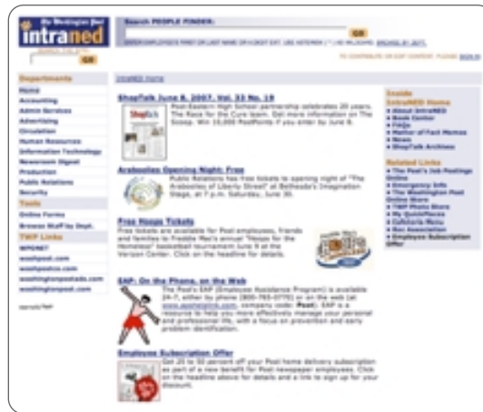
Intraned gets new look and People Finder tool.

Nino also provided the following note: “People Finder serves as an employee direc-