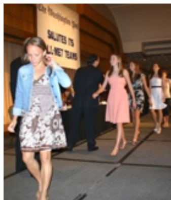
Girls All-Met Track and Field Team marches across the stage to be recognized and receive their medallions.