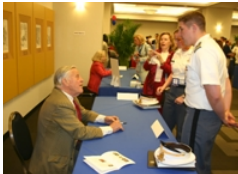
Ben Bradlee , vice president at large, autographed copies of his memoir, “A Good Life: Newspapering and Other Adventures”, and takes questions from West Point cadets and other visitors during a PostPoints community event.

EDITOR’S NOTE: This issue of ShopTalk provides a summary of The Post’s community involvement in 2007. A more comprehensive annual community report will be available in the next few weeks.