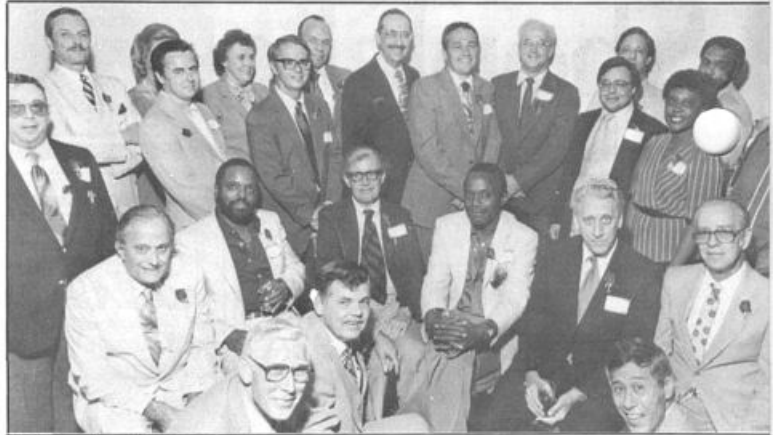
▲ The new members assemble.